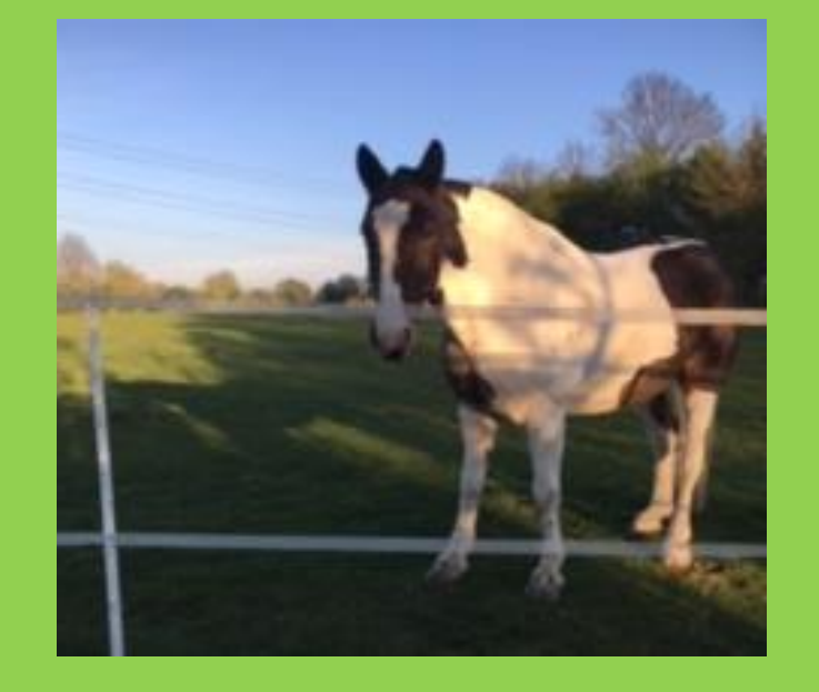
My Fur Babies