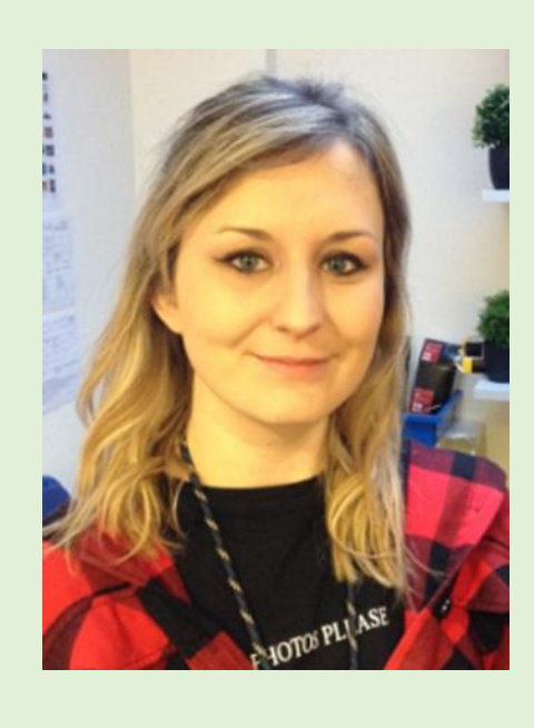
Miss Sharp PPA Cover