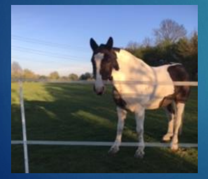
My Fur Babies